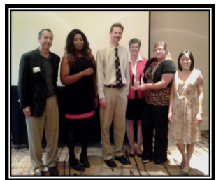
Southern Arizona Legal Aid receives the 2014 Teresa Brice Leadership Award.

Our member meetings included presentations on Smoke-Free Housing, A Healthy Somerton, Affordable Housing Bonds, NAHASDA, and the Navajo Housing Authority Sustainable Community Master Plan.