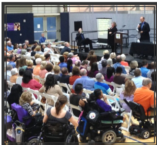
Hundreds attend the 2014 Candidate Forum for Arizona Families.